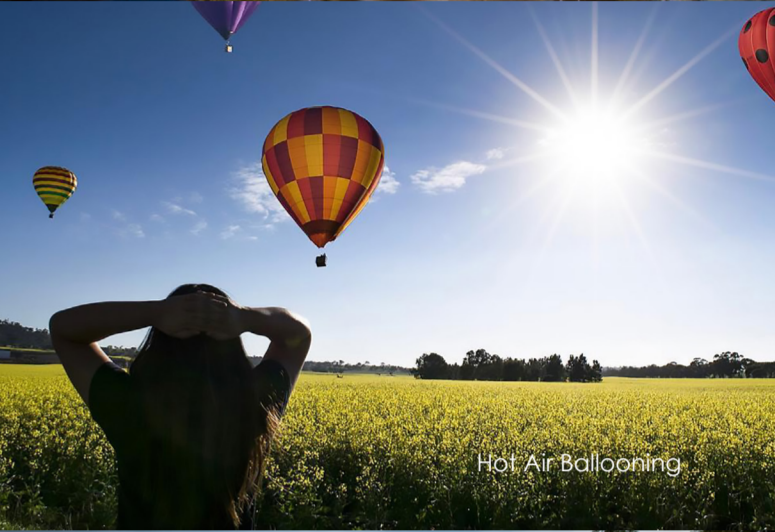
Hot Air Ballooning