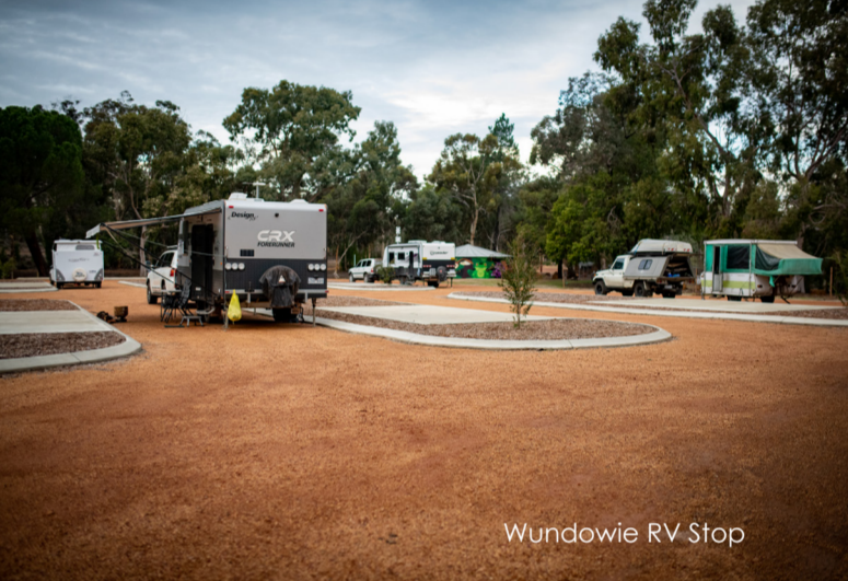
Wundowie RV Stop