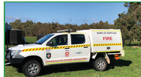
The Shire of Northam is proud to support local Bushfire Brigades. The above vehicle has been provided for the management of fires within the Shire of Northam.

A Harvest Vehicle Movement and Hot works Ban will be advertised on the Shire of Northam Website or Emergency Information Line on (08) 9621 1120. Where possible on ABC Radio 531AM, Radio West 864 AM. Ban updates can be obtained or via a free SMS service which is available upon request from the Shire of Northam (08) 9622 6100.