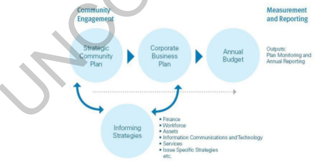
Figure 1 – Elements of the Integrated Planning

The ICT Strategic Plan is one of the informing strategies forming part of the IPR Framework (refer figure 1) and provides a roadmap for ICT operations that will facilitate short-, mediumand long-term community priorities and aspirations