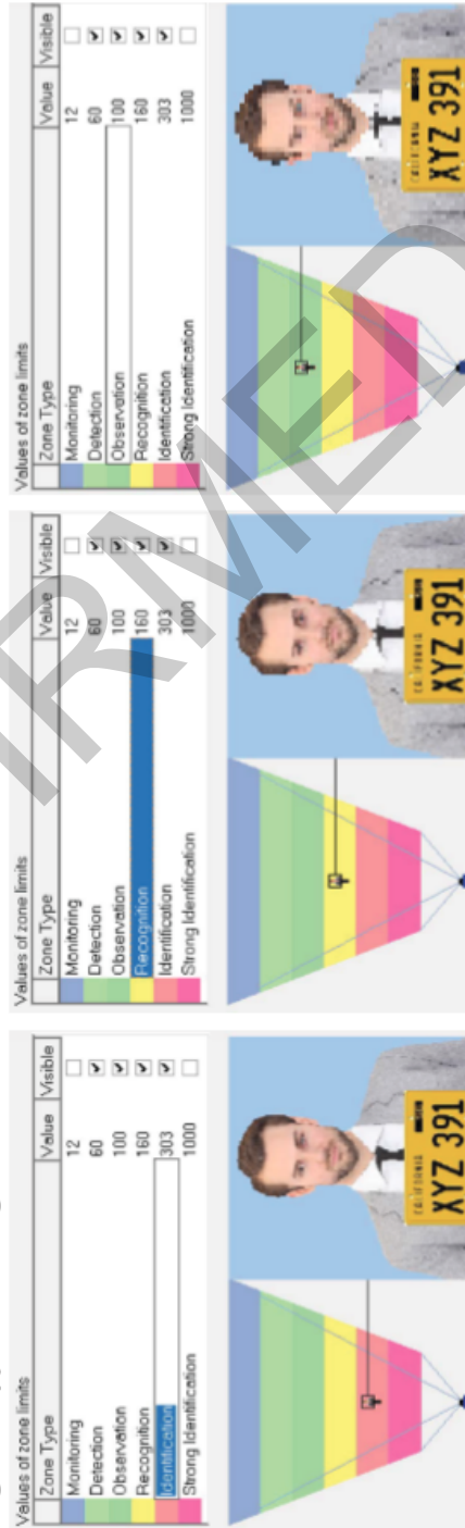
Version 1.4F 020120