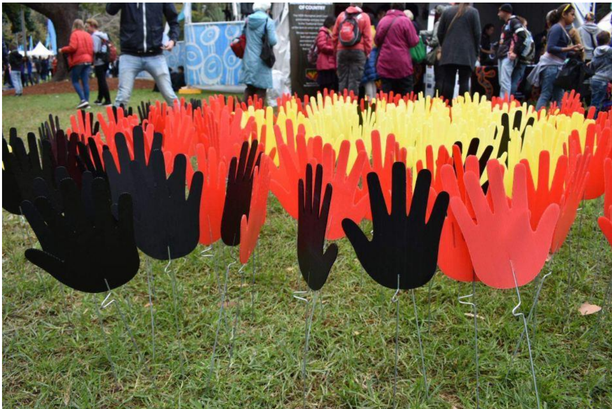
Image of Sea of Hands