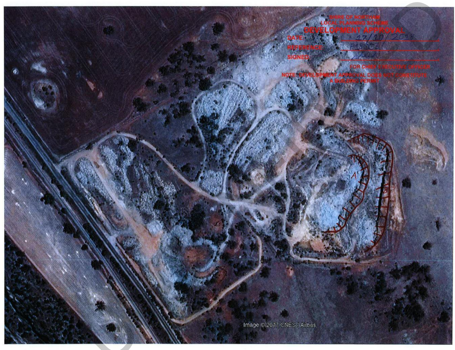
LOCALITED DRILL E BEAST TO REHMS FACES A & B. LAY ENCL TO APPROPRIENT: CARBOTENT.